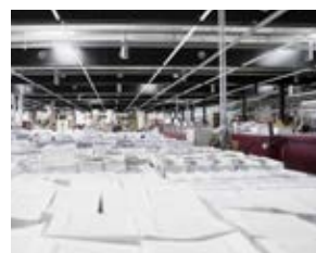
Printing and paper industries